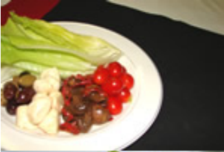
Antipasto Salad with Fresh Mozzarella, Grape Tomatoes and Marinated Olives and Mushrooms