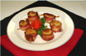
Jumbo Sea Scallops Wrapped in Bacon and Sautéed in Caramelized Brown Sugar