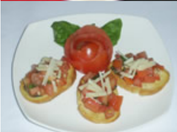
Bruschetta Slats with Fresh Mozzarella Sticks Soaked in Extra Virgin Olive Oil