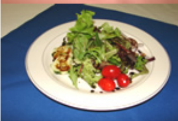
Mixed Green Salad with Grape Tomatoes, Sliced Cucumbers and Red Onions