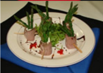
Tenderloin Wrapped Asparagus in a Borsini Cheese