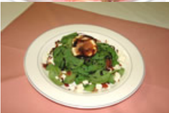
Spinach Salad Topped with Crumbled Bacon, Blue Cheese and Fresh Fig