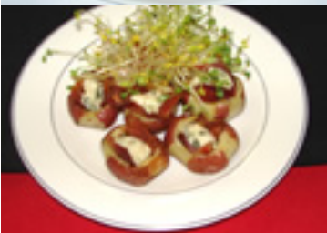
Roasted Red Bliss Potatoes Stuffed with Bacon and Blue Cheese Crumbles