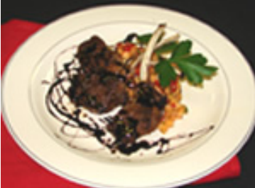
New Zealand Lamb Chops with a Fig Reduction Sauce and Mango Chutney