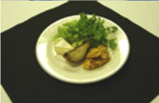
Frisse Salad with Caramelized Pears Candied Walnuts and Brie