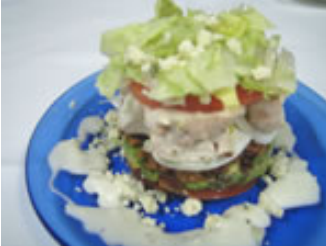
Elevated Cobb Salad with Artichoke Hearts and Sliced Chicken