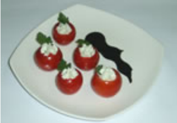
“Crème Fresh” Filled Cherry Tomatoes with a Mint Sprig and Vinegar Reduction Sauce