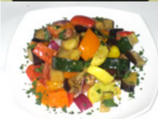
Vinaigrette Infused Fertucci Salad